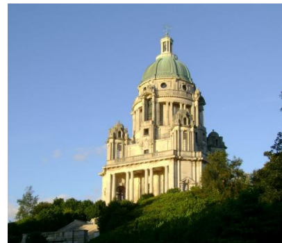
Ashton Memorial, Lancaster

One of the most scenic canals in the country, this gentle waterway offers wonderful views of the Silverdale coast, Forest of Bowland and rolling countryside of Wyre. It was nicknamed 'the Black and White Canal' as it originally carried coal from the south and limestone from the north. The Lancaster Canal stretches over 41 miles from Preston to Tewitfield on one level, England's longest stretch of canal with no locks.