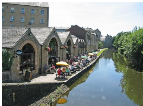
White Cross Public House, Lancaster

Start: University of Central Lancashire Sports Arena